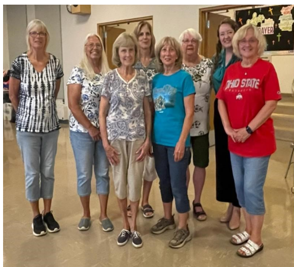
Above is a picture from Thursday, Aug. 21st, from 10 AM - 2 PM of Little Kidz Kloset workday volunteers. These ladies represent different churches and are willing to give of their time to help those in need. Note: Some volunteers could not be there.